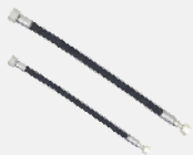
Discharge Hose C/W Check Valve