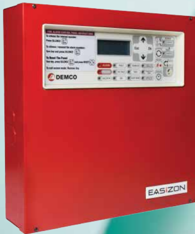
Fire Suppression Control Panel